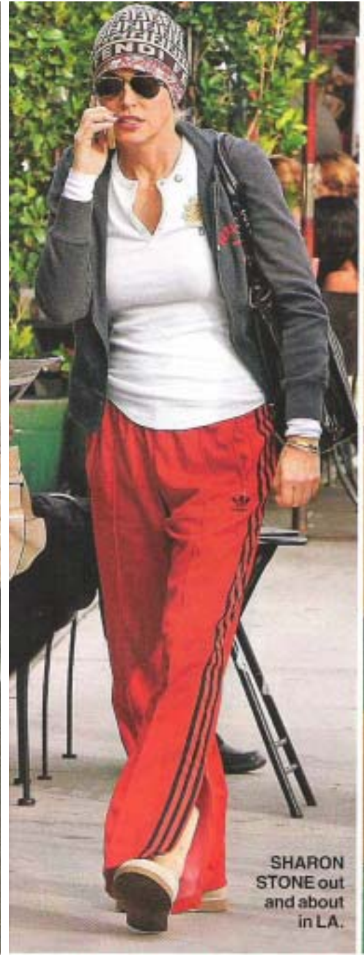
SHARON STONE out and about in LA.