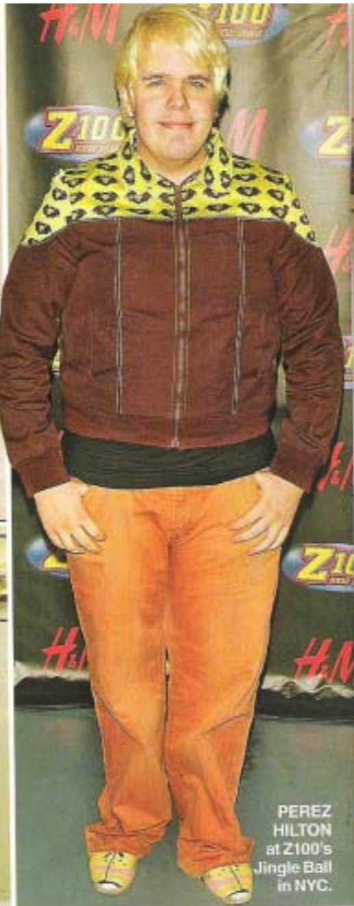
PEREZ HILTON at Z100's Jingle Ball in NYC.