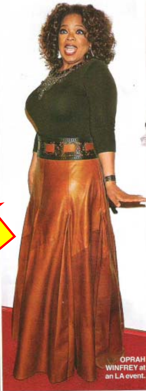
OPRAH WINFREY at an LA event.

Ice T's wife, COCO, doesn't leave a lot to the imagination!