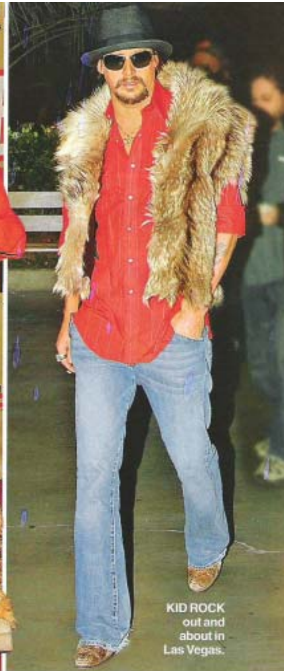
KID ROCK out and about in Las Vegas.